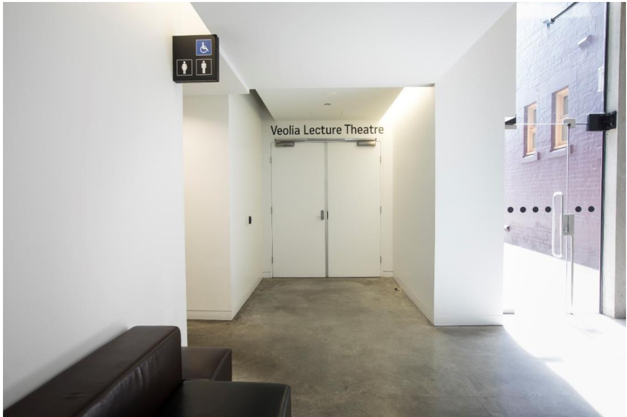
Level 2 Veolia Lecture Theatre Entrance