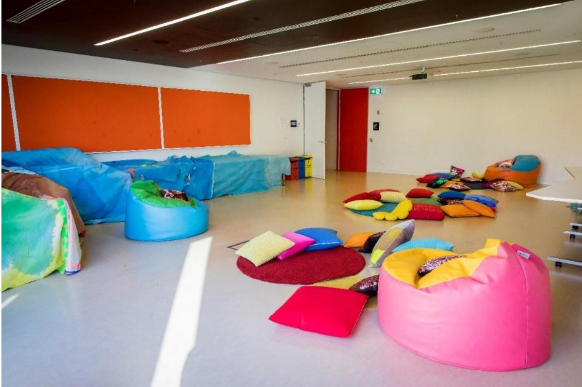
Quiet room in the MCA