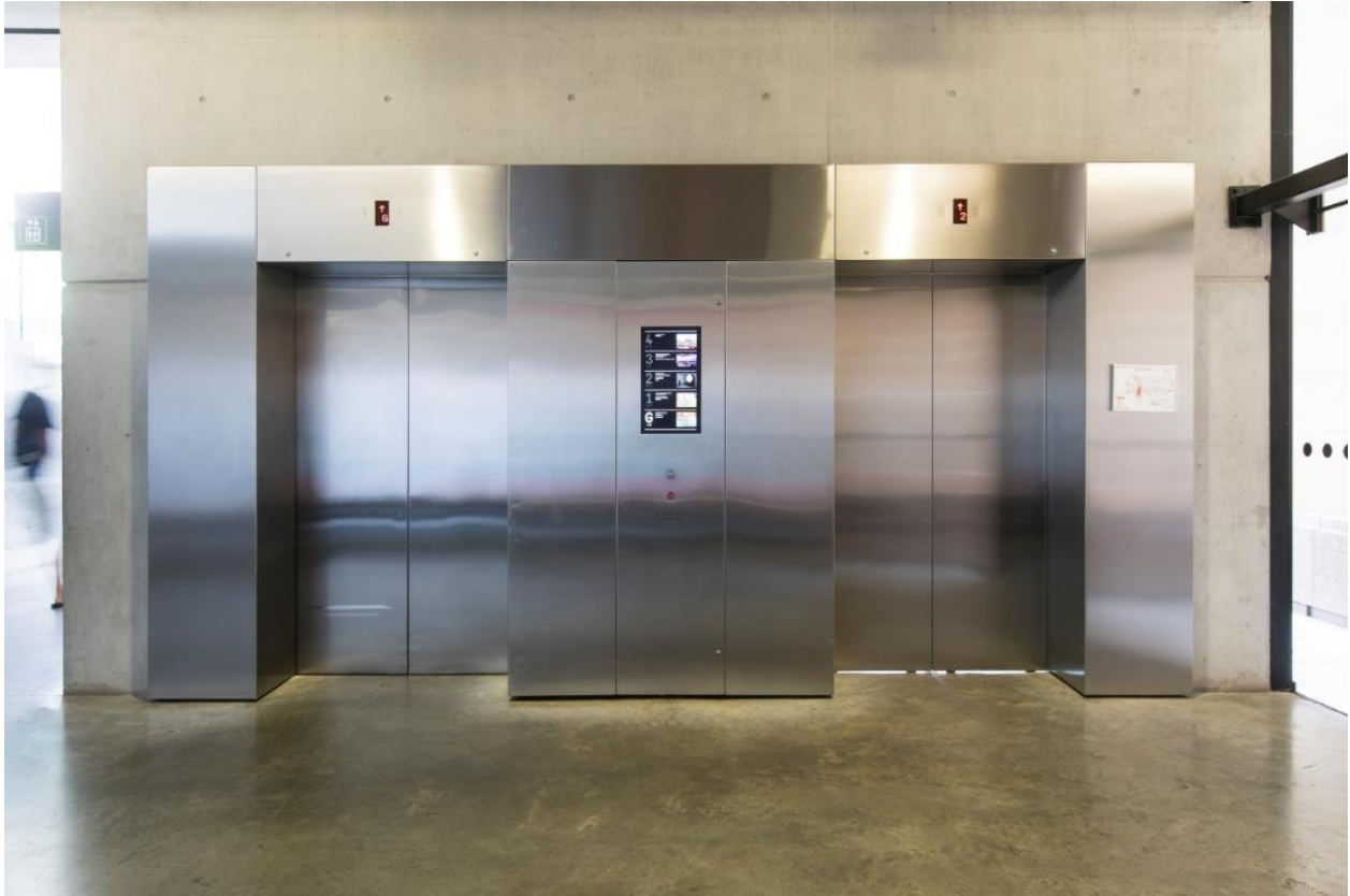
Lifts on the ground floor