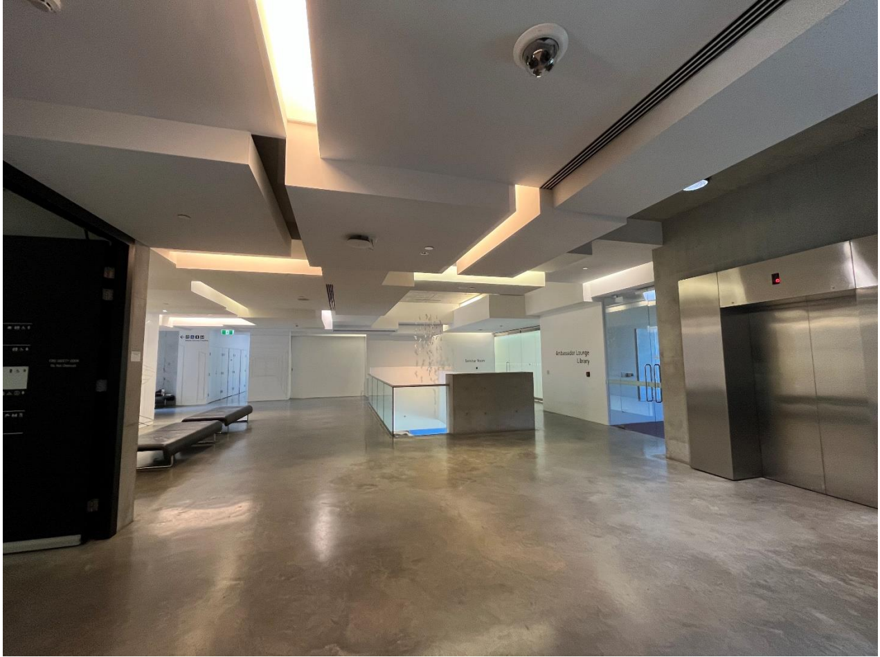
Level 2 foyer