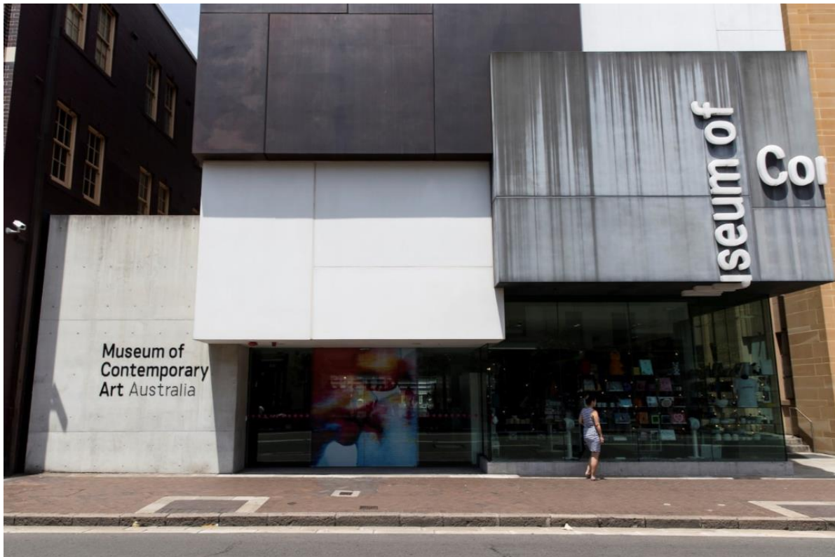
MCA George Street Entrance