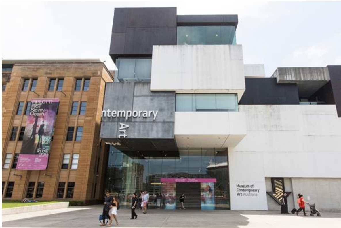
MCA Circular Quay Entrance