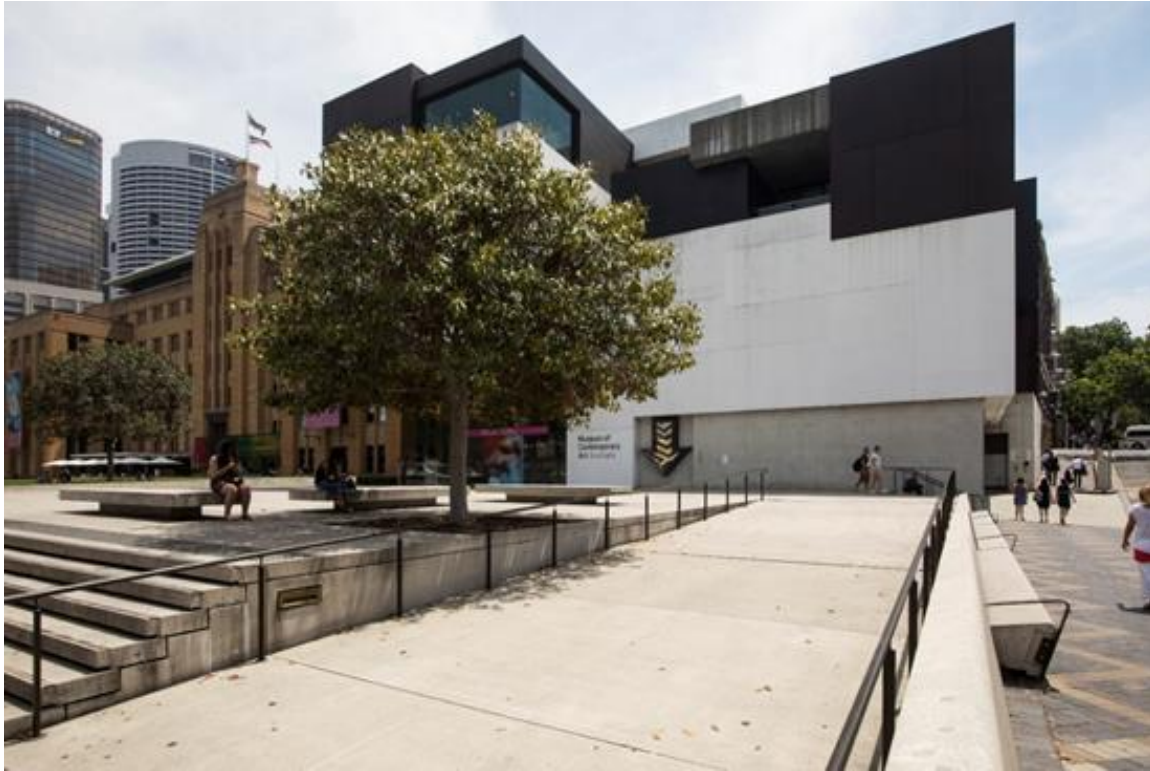
Ramp outside the entrance of the MCA