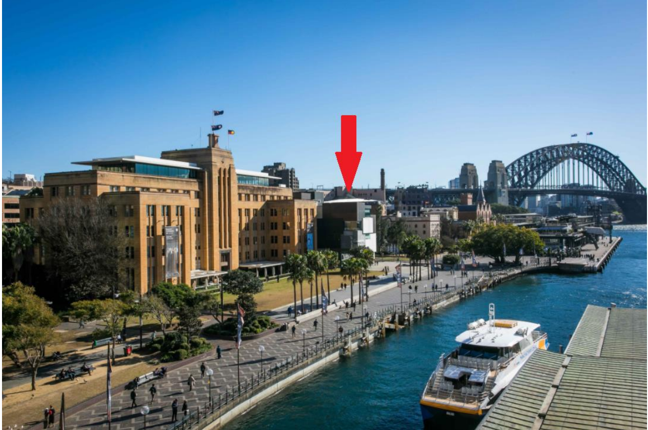
MCA Building with an arrow pointing down to the entrance