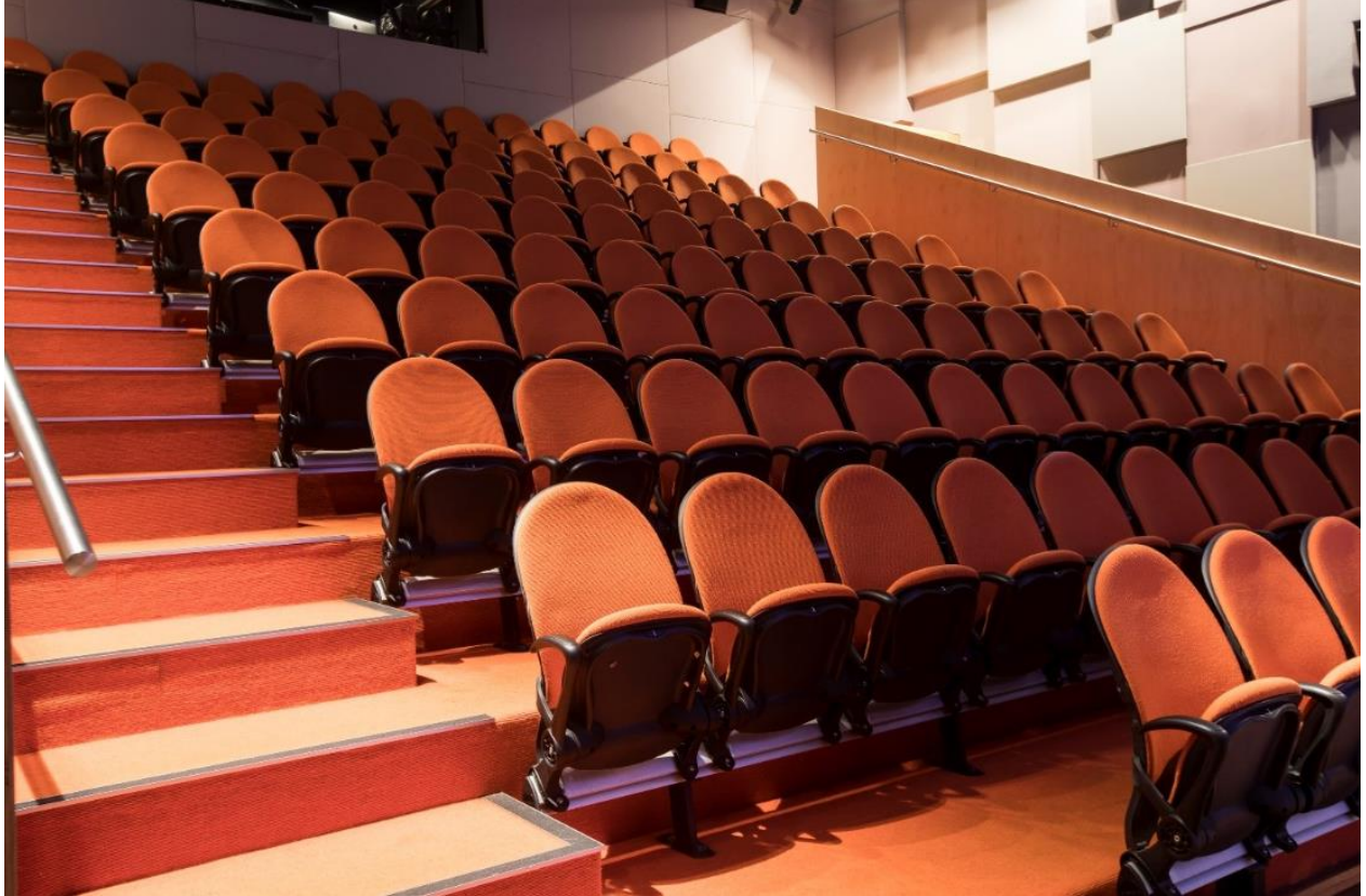
Seats inside the Veolia Lecture Theatre