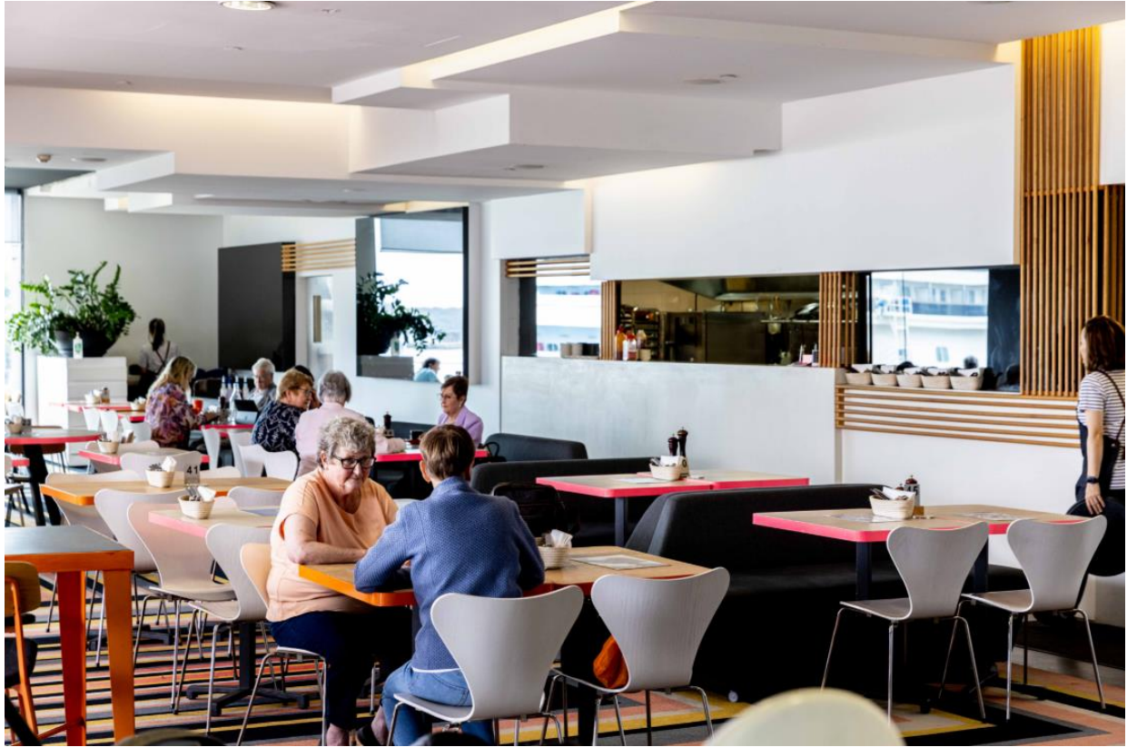
People having lunch in the MCA Café on Level 4