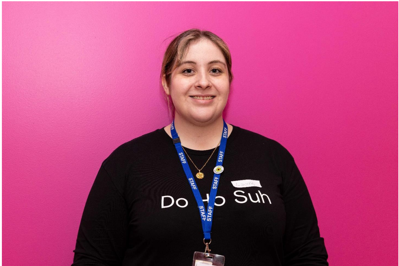
MCA Host wearing black t-shirt