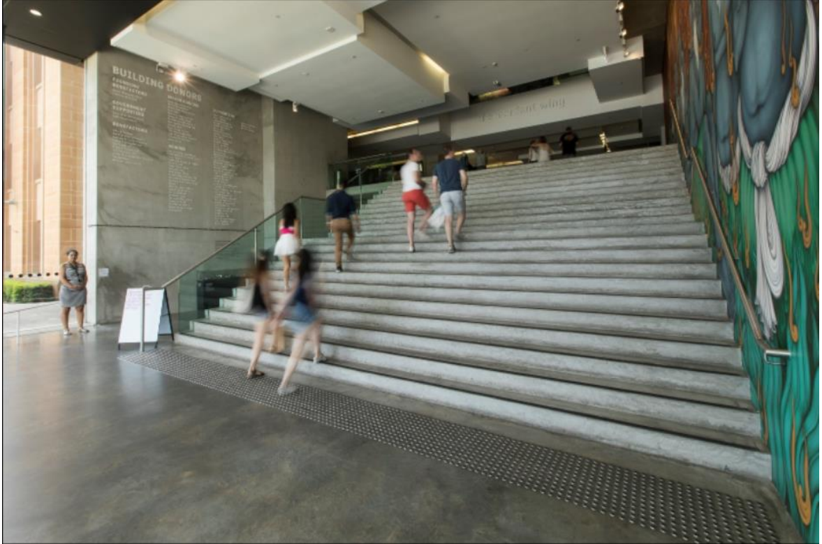
Stairs inside the MCA entrance