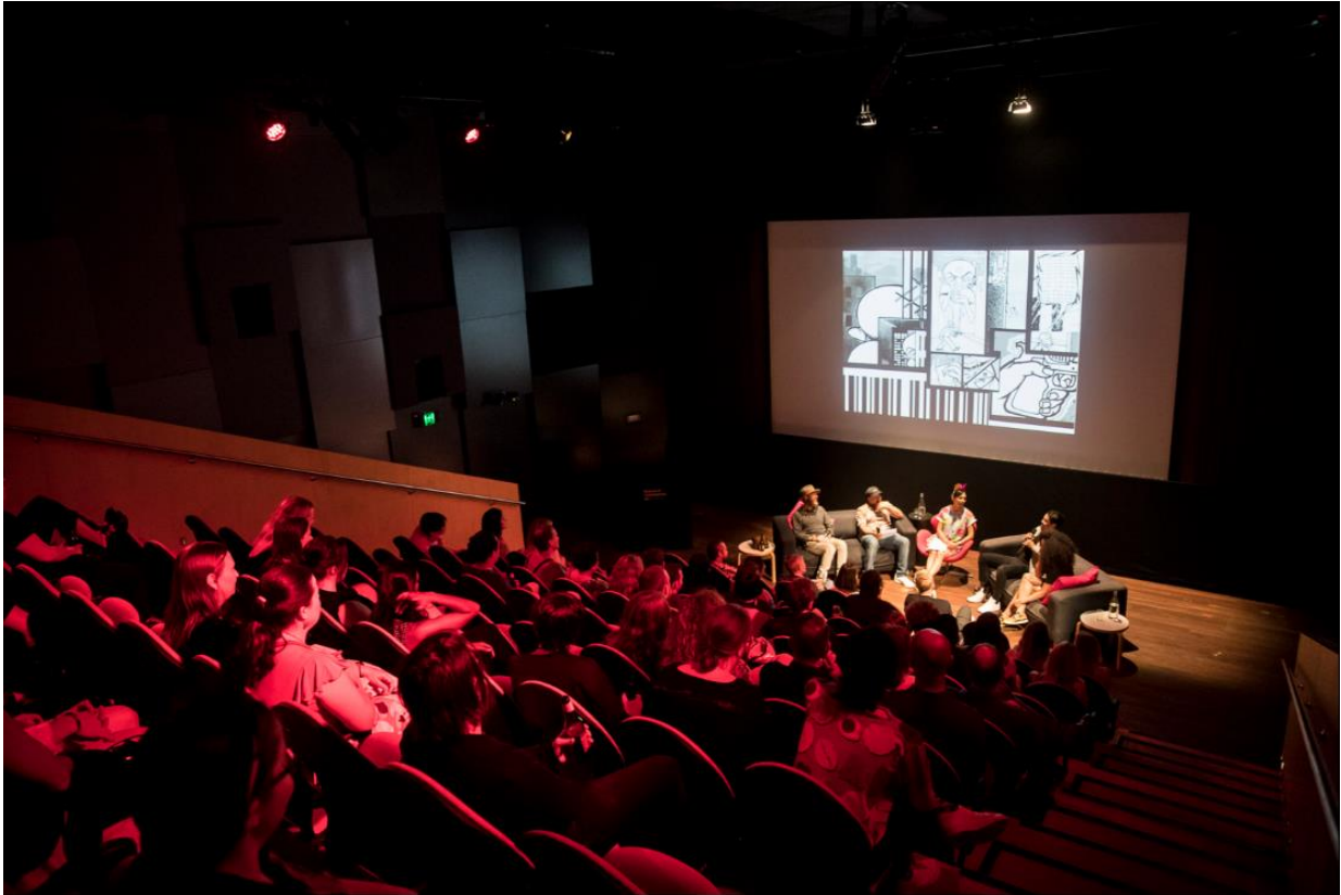
Panel discussion in the Veolia Lecture Theatre